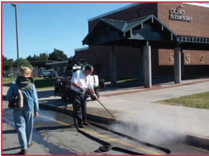
The latest in IPM: Hot water machines kill weeds without herbicide.

The New York State Community Integrated Pest Management (NYS CIPM) Program reduces risks posed by pests and pest control methods in urban, suburban and rural communities