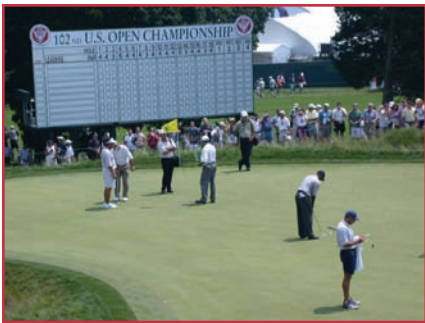
Research at Bethpage State Park has shown that IPM putting greens use 30-66% fewer pesticide applications, and have up to 96% less environmental impact, than conventionally managed greens.